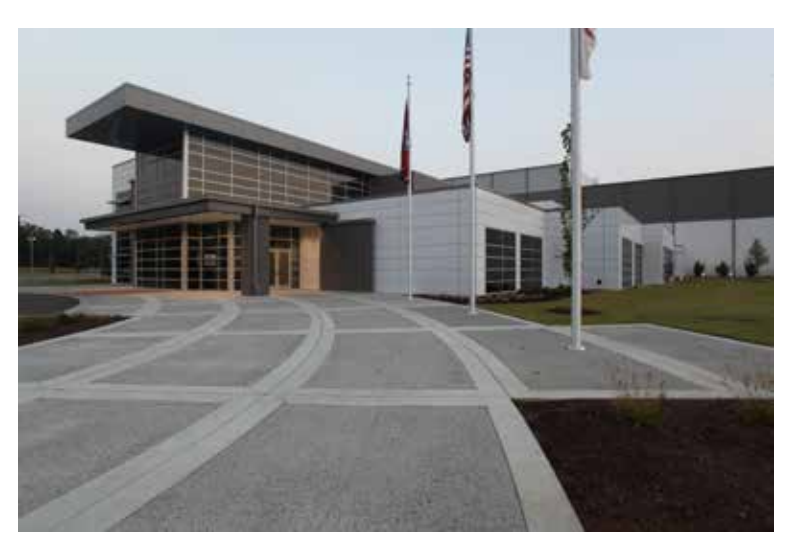
The Utah Paperbox Co. in Salt Lake City is faced with insulated metal panels.

Taken together, IMPs contribute to a strong building enclosure, often capable of supporting spans of 10 feet or more between supports. "The composite bond of IMPs produces a building unit that is much stronger than the individual components, even with very light gauge facings," states the MCA Bulletin.