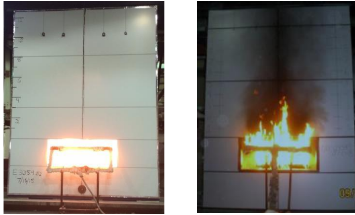
NFPA 285 Test Apparatus