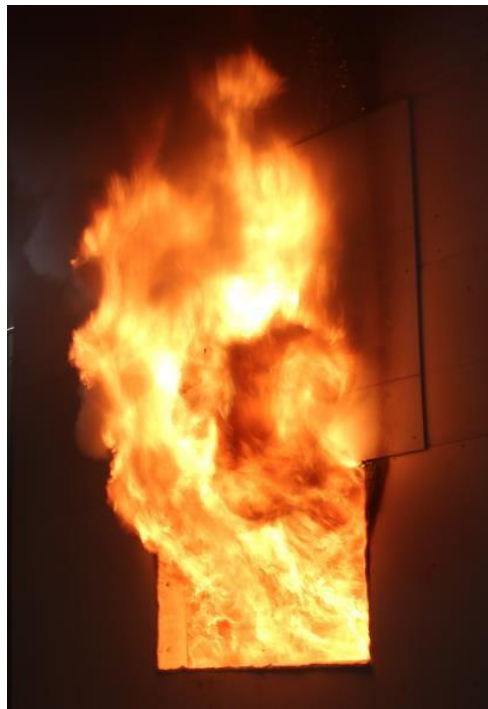
CAN/ULC S134 Test Apparatus