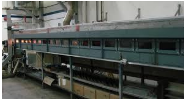
CAN/ULC S102 Test Apparatus

Like the ASTM E84 test, the S102 measures the flame spread and smoke developed of a material sample. The test apparatus is oriented differently than the ASTM E84, however the results still indicate flame spread of a horizontal sample. Each material type must provide Flame Spread and Smoke Developed values that meet the performance requirements of the NBC or governing provincial code.