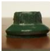
Paint damage from an impact driver

Impact drivers are not recommended for fastening metal panels or composite panels used for roof and/or wall system installation. These tools can also cause damage to the drill points, break screws, chip painted surfaces, and strip threads on Type 300 stainless steel screws. Overdriven screws also damage the EPDM sealing washer and could potentially be the source of water leaks.