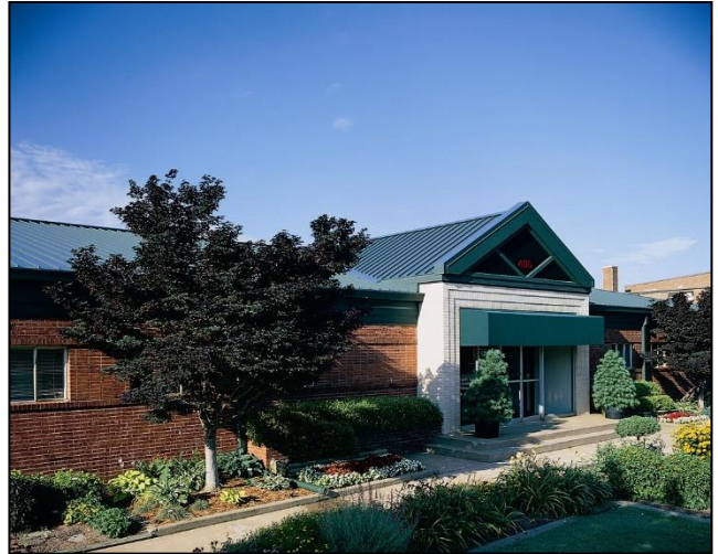
Figure 1- Completed Retrofit Application