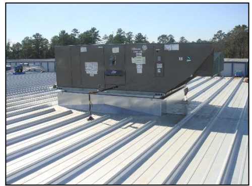
Figure 5 – Air Handler raised to new roof

Existing metal roofs are either ribbed panels or standing-seam panels. In a metal-over-metal retrofit (Figure 7), new sub-framing is installed over existing purlins and joists; some systems are also notched to nest with the existing metal roof profile which will also strengthen the roof's corner and edge wind zone areas and allow for an upgrade to currently adopted building code wind speeds.