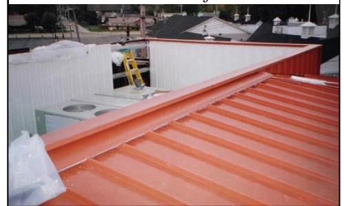
Figure 6 – New HVAC Well