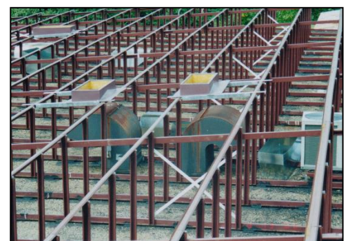
Figure 4 – HVAC Extension to new roof