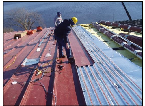
Figure 11 – Solar Heat Recovery System