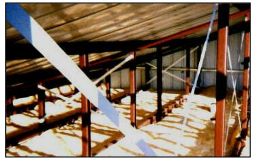
Figure 9 – New Fiberglass Insulation on old roof

Older flat and sloped roofs typically are not energy efficient because of poor insulating qualities and air infiltration. On average, they have thermal resistance (R) values between R-6 and R-10, which is generally far below most locally adopted energy codes. Today, most building codes have minimum R-values based on ASHRAE 90.1 and the Federal Model Energy Code. ASHRAE 90.1 recommends R-26 for metal buildings and R-38 for conventional buildings. Adding roof insulation in a retrofit application can improve the building's thermal efficiency and may also represent a tax benefit to the building owner. Whether a retrofit is over existing flat or sloped roofs, a properly designed and balanced ventilation system must be included in the assembly. Doing so eliminates any potential condensation issues and allows the building to meet airflow rates required by code.