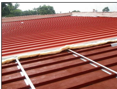
Figure 7 – Metal-over-Metal Retrofit