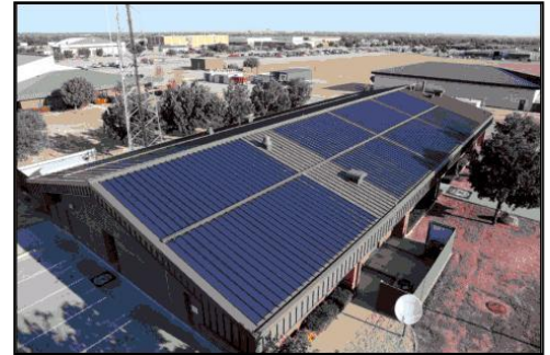
Figure 10 – Laminated Photovoltaic Solar

In addition to the immediate Federal or state rebates and incentives, the building owner will realize savings from reduced energy use throughout the life of the PV system.