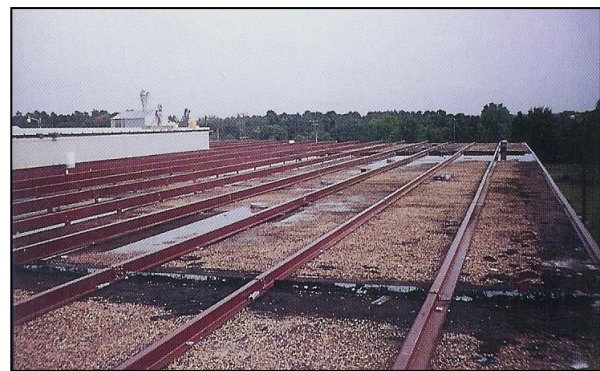
Figure 8 – Low-slope Retrofit over BUR