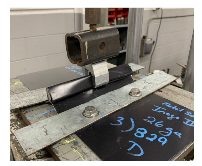
Figure 5: Standing Seam Clip Pull Test