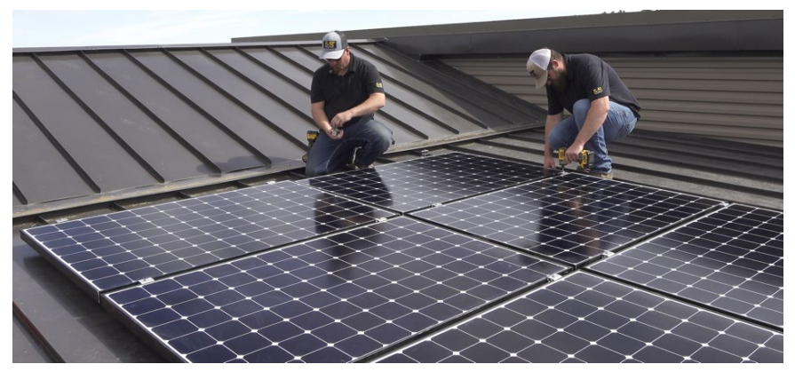
Figure 6: Solar PV Installation on Standing Seam

For a standing seam roof such as the one on Figure 6, the recommended attachment clamps do not penetrate the roof, instead, attach to the seam with a round-point fastener that will not compromise the paint or roof coating. Also, if the clamps fit the seam perfectly, the attachment system will cost less, perform better and install more easily.