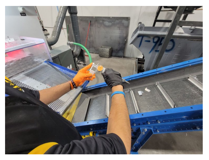
Figure 2: Manufacturer's In-Process Quality Assurance

Finally, quality assurance is accomplished by controls and audits of production materials and fabrication methods. (See Figure 2) This process eliminates finished product defects and variations in procedures that can compromise performance in the areas of quality, chemistry and dimension. Products or systems that cannot provide evidence of compliance with a structured quality assurance program should be considered unsuitable for use due to potential impacts on public safety and structural integrity (see Appendix A for checklist).